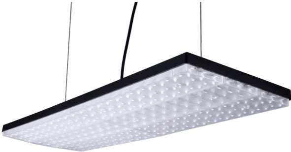
POWER PLATE PND

Keylight International reserves the right to modify or change technical, construction or LED specifications due to continuous improvements of our products and lightsources. The light source in this product can be replaced with an equivalent module made by Philips, Osram or Tridonic.